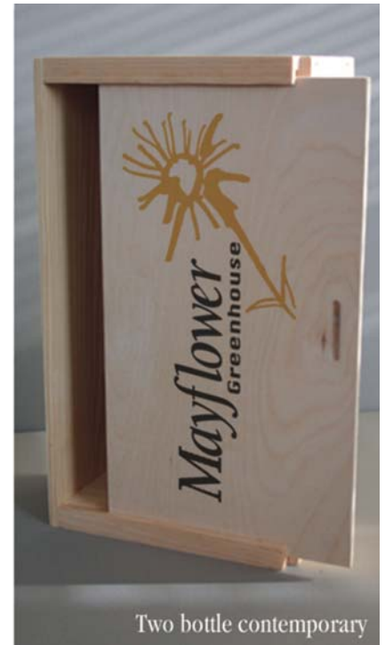
Two bottle contemporary