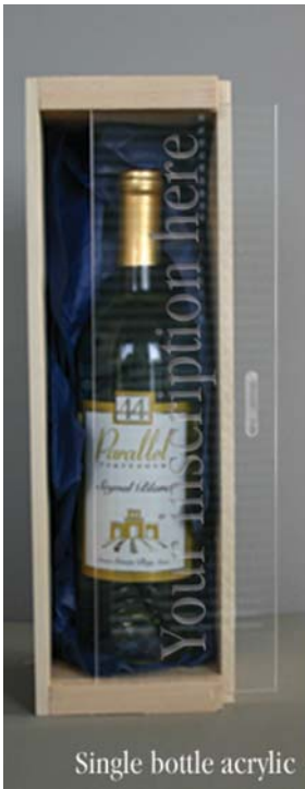
Single bottle acrylic

Dufek Wood Products QUALITY IN WOOD Since 1905